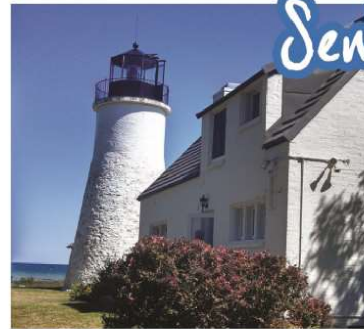
Old Presque Isle Lighthouse "The Haunted Light,"