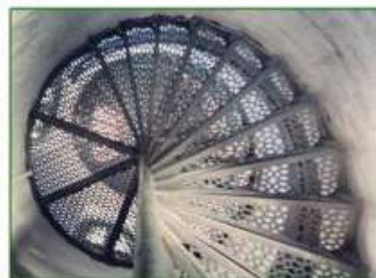
Left photo: Middle Island Light; Top Right photo: Bollards at the Old Presque Isle Lighthouse; Bottom Right photo: New Presque Isle Light staircase.