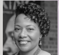
Bernice King CEO of The King Center; Founder, Be A King, Author, "Hard Questions Heart Answers"

Leadercast Women is the world's most unique women's leadership experience featuring top female leaders who are powered by purpose. Throughout the day, they will share their experiences, strategies, expertise, and provide relevant takeaways that will help you grow as a leader. This event is open to men and women.